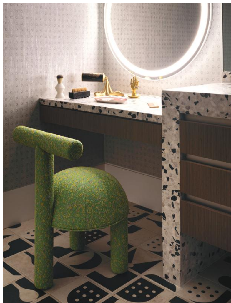
Clockwise from top left: A patterned floral carpet by Stark adds interest in the guest room; the Playful Pink Poodle sculpture by Barone Art and a turquoise tub set the stage in the primary bathroom; with Concrete Collaborative countertops and black-and-white porcelain flooring, the guest bathroom stands out.