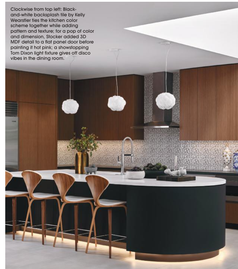
Clockwise from top left: Black-and-white backsplash tile by Kelly Wearstler ties the kitchen color scheme together while adding pattern and texture; for a pop of color and dimension, Stocker added 3D MDF detail to a flat panel door before painting it hot pink; a showstopping Tom Dixon light fixture gives off disco vibes in the dining room.

design,” Stocker shares. “Although there was not one piece, in particular, that inspired the design, we were thoughtful while sourcing and found inspiration in all aspects of the desert lifestyle.”