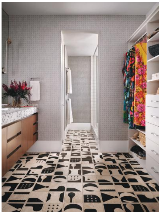
From top: The exposed closet space in the guest bathroom allows colorful Palm Springs attire to be part of the decor; the primary bedroom features patterned wall-to-wall carpet by Shaw Contract and a glam bed upholstered in crushed velvet Opuzen fabric.